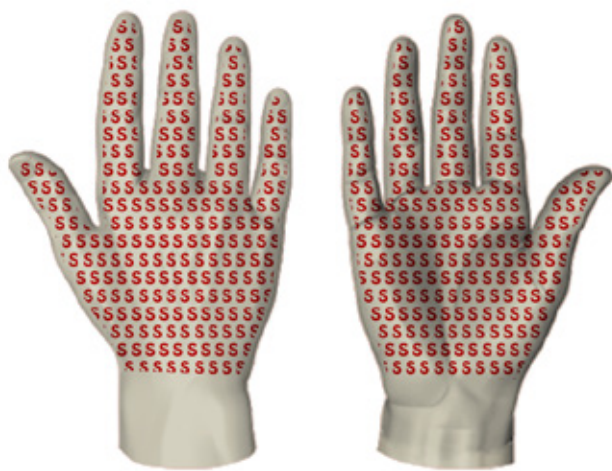
■ Coated Area