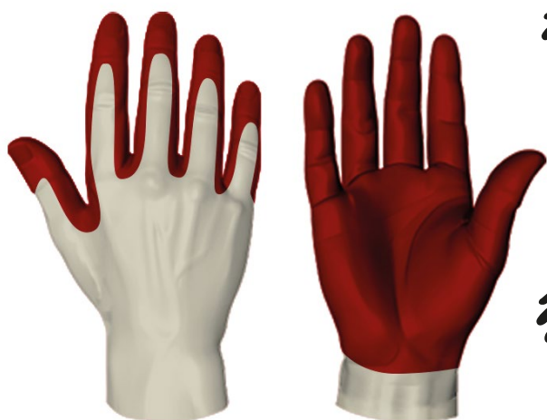
■ Coated Area