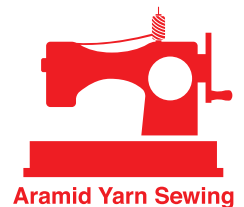
Aramid Yarn Sewing

All stitches were made with non-combustible aramid yarn to increase the strength in welding work.