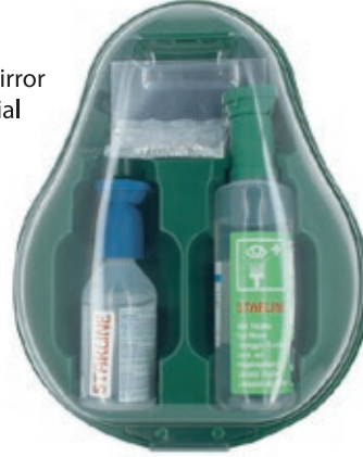
CPS024 - Eye Shower Station (1Piece ACQ425 + 1Piece ACQ426 + 1Piece Mirror)

Mounting materials 1 piece wall board 1 piece mounted on the panel mirror 1 piece set of mounting material (dowel-screw)