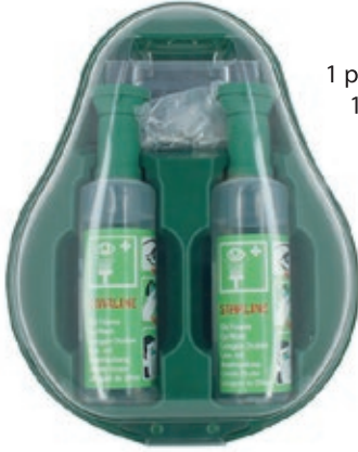
CPS023 - Eye Shower Station (2Pieces. ACQ425 + 1Piece Mirror)

Two eye shower stations sold in groups are listed below.