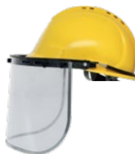
YS-53 + YS-54-C