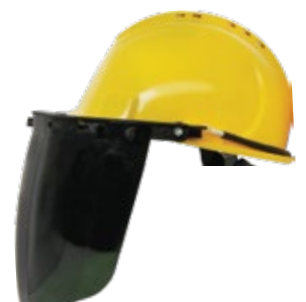
YS-53 + YS-55-G