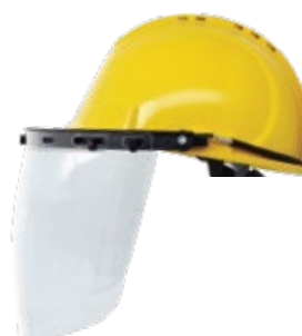
YS-53 + YS-55-C